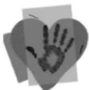
Foster Children's Foundation, Inc.