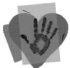
Foster Children's Foundation, Inc.

The Foster Children's Foundation, Inc. is a non-profit organization established by a large group of high energy, positive business leaders and caring individuals in our community. The Foundation will continue to provide for un-met needs of foster children. The Foundation plans to conduct activities to raise these children's self-esteem, teach and nurture and let them know they are cared for.