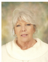
Happy Spring DMA Members!

Thank everyone who enjoyed the fantastic meeting we had on April